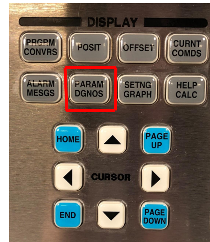
CHC or Legacy Control